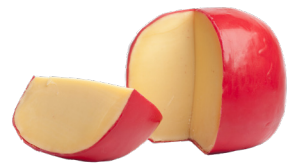
Austrian Mild Edam Cheese