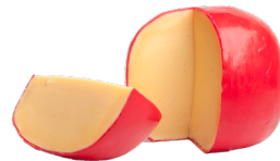
Landana Mild Gouda Cheese