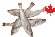
Wild Caught Fresh Whiting