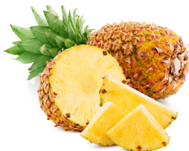
Golden Pineapples Product of Costa Rica