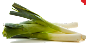
Leeks Product of Canada