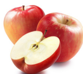
McIntosh, Lobo, Spartan or Empire Apples