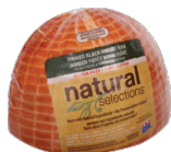
Natural Selections Black Forest Ham