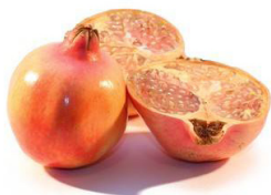
Spanish Pomegranates Product of Spain

SPECIALS IN EFFECT NOVEMBER 7 - NOVEMBER 13, 2018