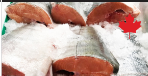
Fresh Atlantic Salmon Roasts