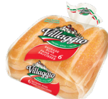
Villaggio Hamburger or Sausage Buns