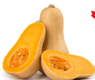
Butternut, Buttercup, Spaghetti or Pepper Squash