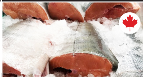
Fresh Atlantic Salmon Roasts