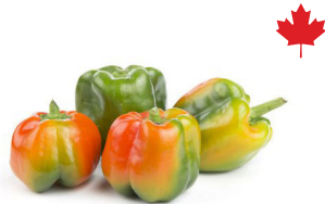
Suntan Peppers Product of Canada