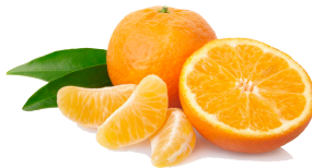
Clementines Product of Argentina