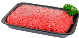
Fresh Lean Ground Beef