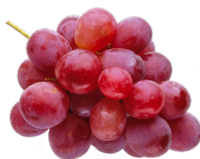
Red Seedless Grapes