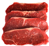
New York Striploin Steak