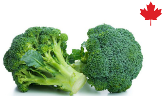
Broccoli Product of Canada

SPECIALS IN EFFECT SEPTEMBER 5 - SEPTEMBER 11, 2018