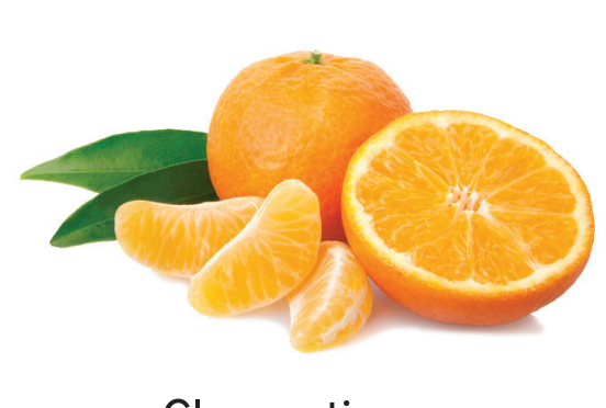
Clementines Product of Spain