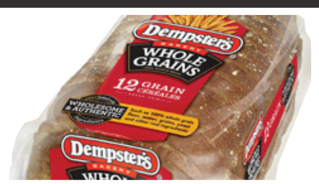
Dempster's Grain Breads