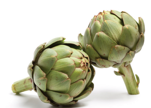
Artichokes Product of U.S.A.