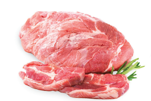
Fresh Pork Picnic Shoulder Roast