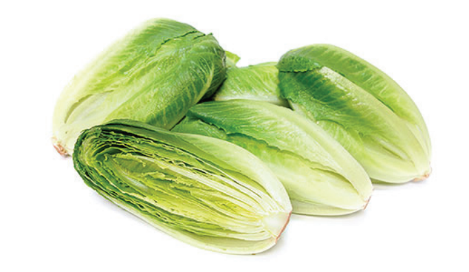
Romaine Hearts 2/$5 Pkg/3 Product of U.S.A.