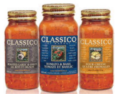
Classico Pasta Sauces