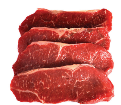
New York Striploin Steak