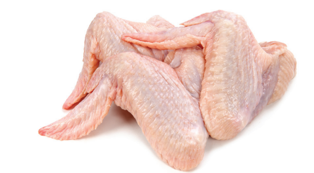
Fresh Chicken Wings