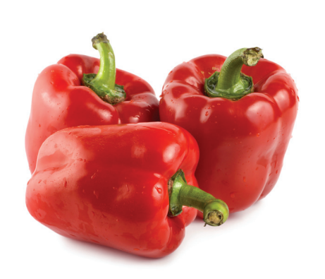
Sweet Red Peppers Product of Mexico