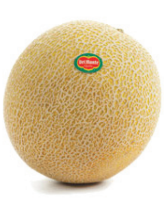
Mag Melons Product of Guatemala