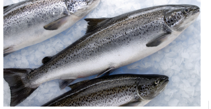
Fresh Whole Atlantic Salmon