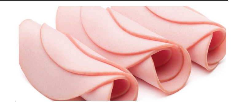
Schneiders All Beef Bologna