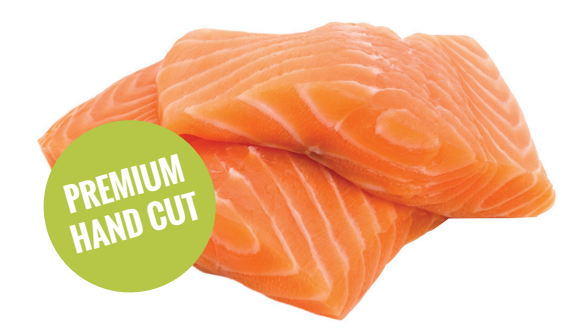
Fresh Atlantic Salmon Fillets