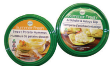
Summer Fresh Dips & Hummus