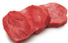
Gourmet King Steak Tenderized Inside Round