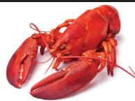
Wild Caught Cooked Lobster