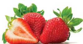
1 Lb Strawberries

SPECIALS IN EFFECT JUNE 20 - JUNE 26, 2018