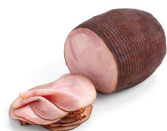
Brandt Black Forest Ham