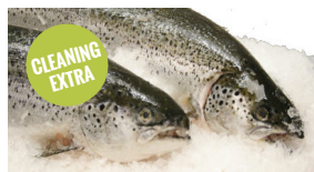
Fresh Whole Atlantic Salmon