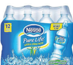
Nestlé Spring Water