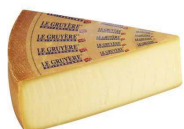
Superbe Gruyère or Swiss Emmental Cheese