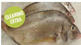
Wild Caught Fresh Porgies