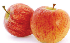
Royal Gala Apples