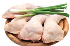
Chicken Leg Quarters