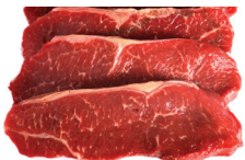
New York Striploin Steak