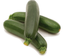
Zucchini 79¢ /lb Product of Canada