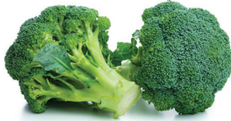
Broccoli Product of Canada