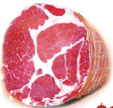
Mastro Capicollo Ham