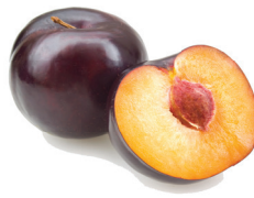
Black Plums $1.69 /lb Product of Spain