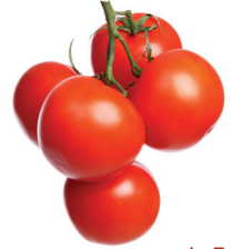
Cluster Tomatoes Product of Canada