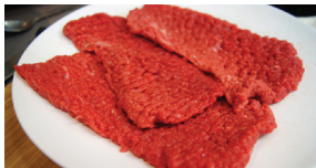
Tenderized Minute Steak