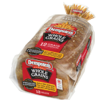
Dempster's Grain Breads