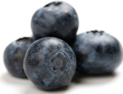
Blueberries Product of Canada