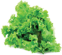
Green or Red Leaf Lettuce 79¢ /ea. Product of Canada