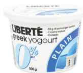
Liberté Greek Yogurt