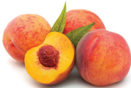
Peaches $1.49 /lb Product of U.S.A.