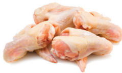
Fresh Chicken Wings $199 /Lb 4.39/kg