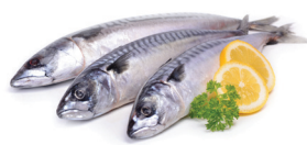
Mackerel $299 /Lb 6.59/kg Product of Canada