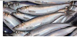
Herring $299 /Lb 6.59/kg Product of Canada