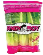
Romaine Hearts Product of U.S.A.