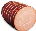
Assorted Mortadella $179 /100g