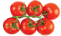
Cluster Tomatoes $129 /Lb Product of Canada