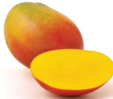
Haden Mangoes Product of Mexico