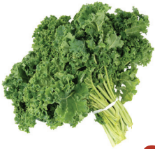
Kale Product of U.S.A.

SPECIALS IN EFFECT MAY 23 - MAY 29, 2018