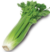
Celery $129 /ea. Product of U.S.A.