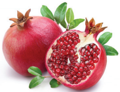
Large Pomegranates 2/$5 Product of Peru