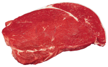
Top Sirloin Steak $599 /Lb 13.21/kg