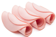
Blue Ribbon Bologna