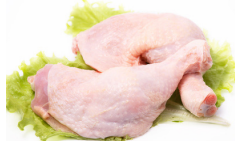
Chicken Leg Quarters