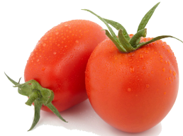
Roma Tomatoes Product of Mexico