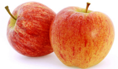
Royal Gala Apples