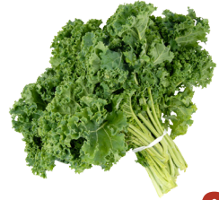
Kale Product of U.S.A.