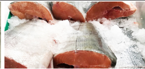
Fresh Atlantic Salmon Roasts